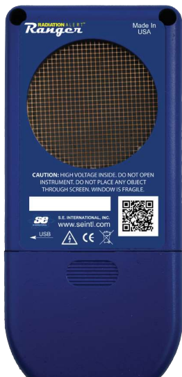
Detector Window and AA Battery Door on Back