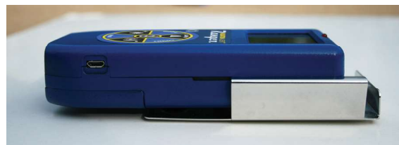
Optional Wipe Test Plate Shown

元翔五金行 電話：04-22615775 傳真：04-22621395 住址：台中市復興路二段120之19號 http://yuansum.myweb.hinet.net